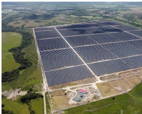
Avanzalia Panama's Penonomé solar project in Panama.

DMEGC Solar obtains extended stress tests certification from TÜV Rheinland NEWS