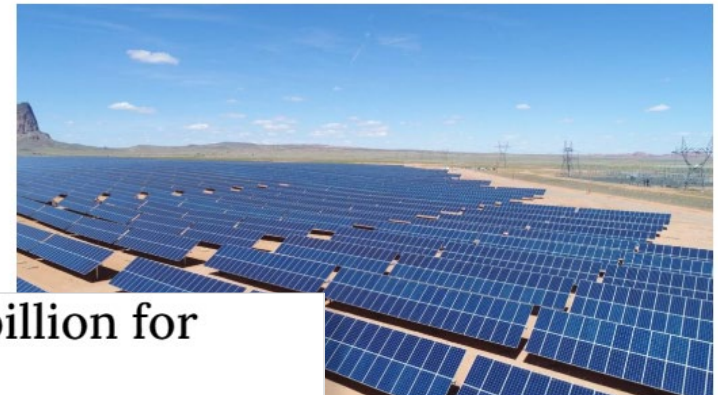
es by 2050.

PV module procurement – US factory announcements add to complexity FEATURES, GUEST BLOG