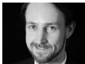
Matt Black Chair SOLAR ENERGY UK